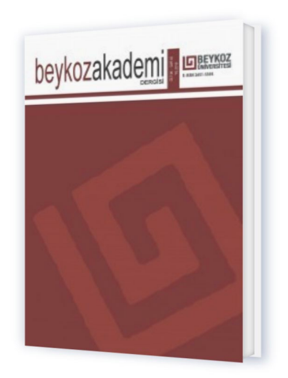
Figure 1. Title sample

Source: Times New Roman, 10 point, left aligned, only the text "Source" in Bold.