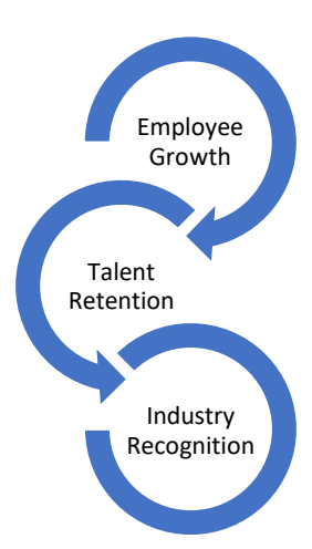
Diagram 2. Significant Outcomes of THY Aviation Academy

THY's emphasis on leadership development reflects its commitment to cultivating a skilled and effective workforce. Through customized programs, global experiences, and the establishment of the Leadership Academy, the company has not only enhanced its employees' leadership capabilities but has also set an example in effective leadership development within the aviation sector.